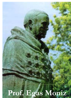
Prof. Egas Moniz

The EANS Research Committee organizes every year a course on “Methodology of Research and Publication”, attempting to improve knowledge and motivation on scientific research among European young neurosurgeons.