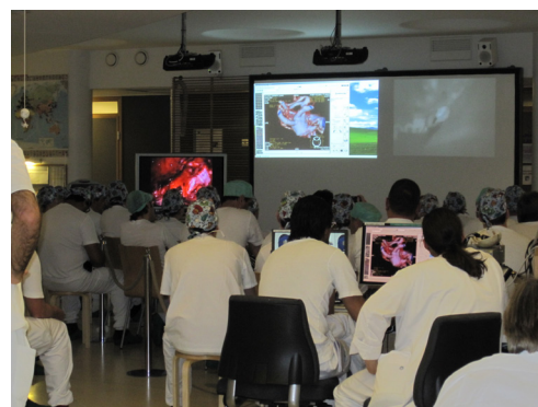
Course participants during the course in 2010